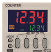
Light gray (sold separately)

Note: Black front panel is a replacement part.