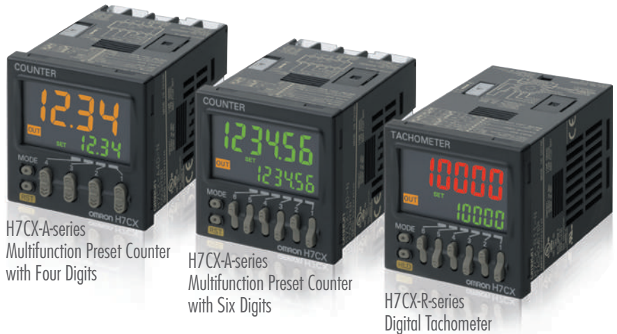
H7CX-A-series Multifunction Preset Counter with Four Digits