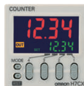
White (sold separately)

OMRON ELECTRONICS LLC • THE AMERICAS HEADQUARTERS • Schaumburg, IL USA • 847.843.7900 • 800.556.6766 • www.omron247.com