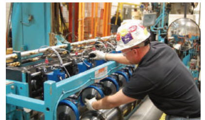
Changing slitter blades manually can be a dangerous task.

The round slitter blades that cut the paper in JSI’s machines are extremely sharp and can be dangerous to handle manually. Therefore, JSI and Millennium Controls designed a robotic blade-changing system using a robotic arm from Fanuc Robotics. The robot changes the sharp blades automatically, without operators having to touch them. But even if the blades can be changed automatically, operators still have to go up to the HMI of the machine which put them in close vicinity to the sharp blades. Therefore, JSI and Millennium Controls looked for a way to access the machine from a distance.