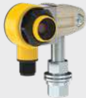
SMBAMS22P add -SS to model number for stainless steel models